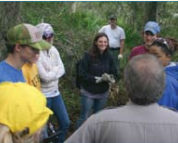
Trailblazing, Pescatello Island Timucuan Preserve, Duval County

by speaking publicly at civic, religious, community organizations, and schools. Booths are utilized at trade shows and events to promote the organization. Clean-ups, trail rides, walking tours, and educational seminars are held to engage and empower the community to support NFLT.