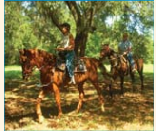
VIP Horseback Rides, Princess Place, Flagler County

NFLT generates interest in the organization and its mission