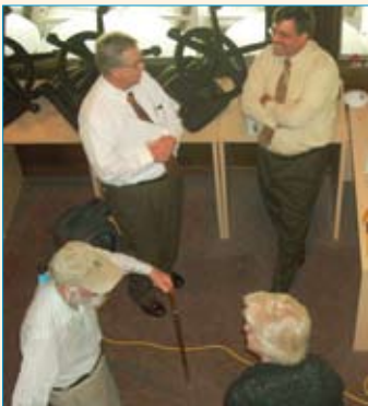
Tour of Legacy School with landowner and public officials, Princess Place, Flagler County