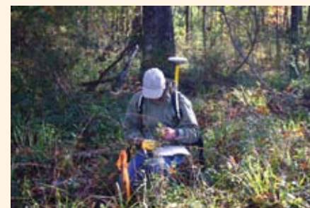
Site assessment on 160 acre/St. Mary's River future conservation easement, Nov. 2008

working to conserve their lands. It takes considerable research and personal education to visualize and capitalize on recognizing opportunities to present as conservation options to landowners. There are so many tools available to help someone preserve their special place, it's a matter of finding them and working to make the ideas a reality.