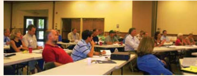
Moneymaking Options for Your Land Conference, Sept. 2008

North Florida Land Trust has a dedicated board and committees that are incredibly motivated to make a difference in our community. At a time when the economy is sluggish, land conservation could be at its greatest, given the resources to scoop up some of the treasures we've been aspiring to conserve for water resource protection and to maintain the balance between agriculture, preservation and economic development. It's a great time to be working on our mission and helping this organization complete the many projects underway.