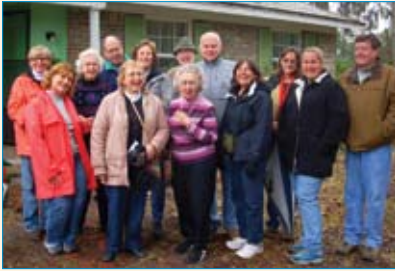
Tour of Pumpkin Hill, Duval County

In the past 12 months, public relations efforts have resulted in an increase of North Florida Land Trust's donor base by over 25 percent and a subscribed digital outreach growth of 1,000 percent.