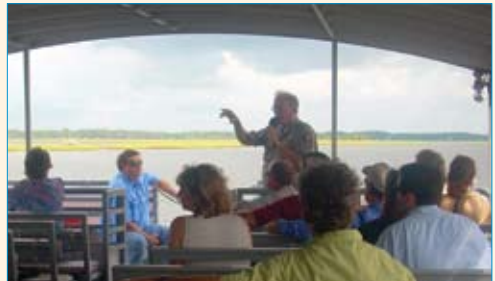
Boat tour of Timucuan Preserve Landscape architects' tour

Postage for this report is made possible by the generous support of