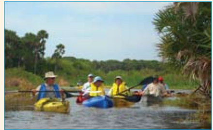
Kayaking Tour of Goelz Preserve Ponte Vedra Beach, St. Johns County